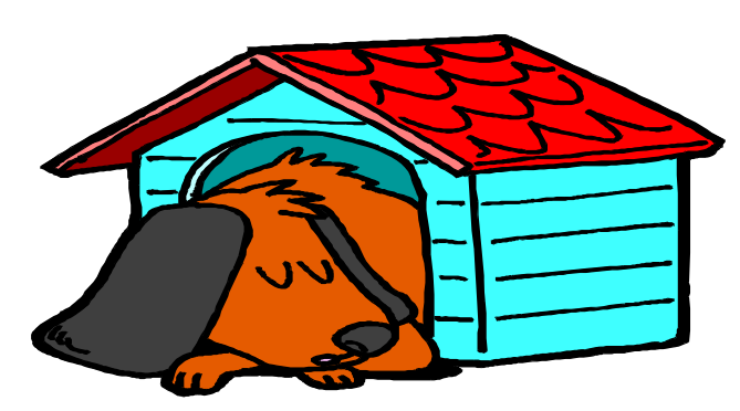
Places to rest you & your dogs...

Don't forget, we will have HCA T-Shirts, Sweatshirts, Ball Caps, and Lapel Pins for sale.