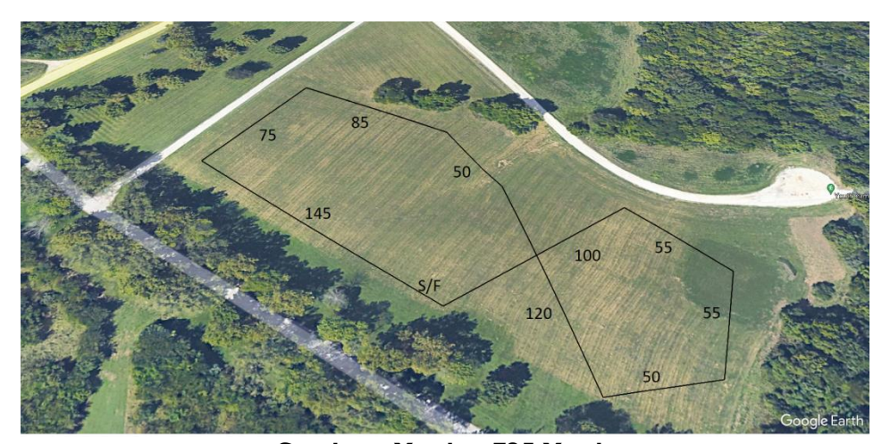
Sunday - Yards - 735 Yards